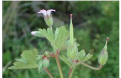
Round leaved geranium ( Geranium rotundifolium ), San Diego Creek Channel, 04-22-20 Few reliable OC records. Non-native.