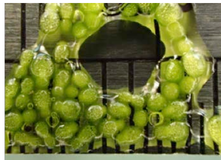
Columbia water meal ( Wolffia columbiana ), Huntington Central Park, 04-15-20 World's smallest vascular plant, 1 mm. Second OC record.