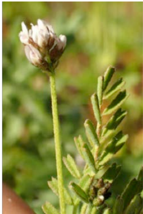
Locoweed ( Astragalus gambellianus ), Pectin Reef, Aliso Viejo, 04-01-20 First coastal record for OC. Nativity uncertain.