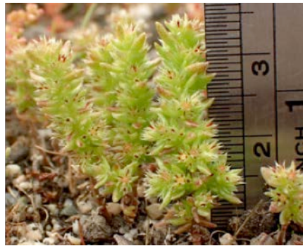
Australian Pygmyweed ( Crassula colligata ssp. lamprosperma ), Santa Ana River basin, E Yorba Linda, 04-11-20 First OC record for this tiny succulent. Non-native but spreading.