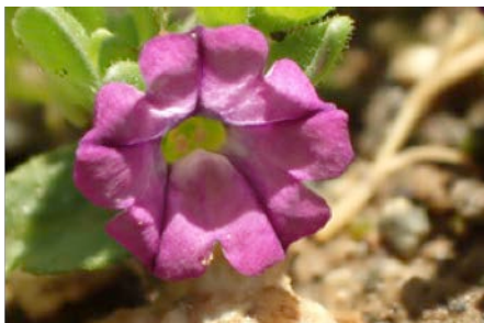
Wild Petunia ( Petunia parviflora ), Quail Hill, Irvine, 03-23-20 A good-size population of this uncommon, tiny native petunia.