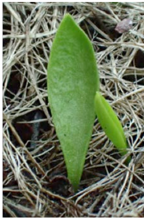
California adder's tongue ( Ophioglossum californicum ), Nr. Whiting Ranch Wilderness Park, 04-25-20 One of only two OC colonies. Discovered 2018, now collected for the UCI Herbarium.