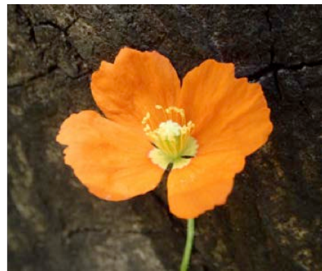
Fire Poppy ( Papaver californicum ). Leach Cyn., Santa Ana Mts., 04-26-20 Not especially uncommon, but a rather strict fire follower. Holy Fire burn site.