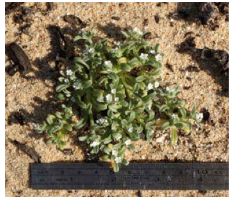
Coastal Popcorn Flower ( Cryptantha leiocarpa ), Balboa Peninsula, 04-14-20 Southernmost colony in the U.S. Also collected for the UCI Herbarium.