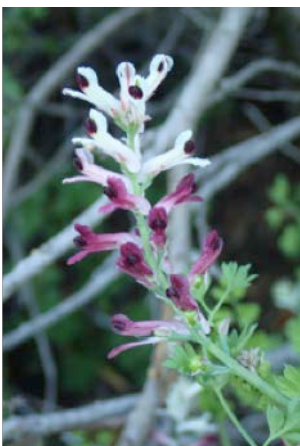
Field Fumitory ( Fumaria agraria ), Upper Newport Bay, 04-04-20 Only CA colony. Discover 2017 and now collected for the UCI Herbarium. Non-native.