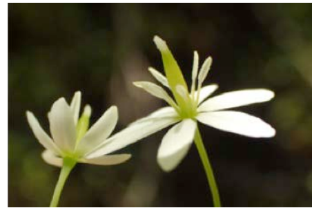
Small Flowered Meconella ( Meconella denticulata ). Leach Cyn., Santa Ana Mts., 04-26-20 Huge colony of thousands. Uncommon tiny annual. Poppy family..