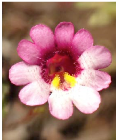
Palomar Monkeyflower ( Erythranthe diffusa ). North Main Divide Rd., Santa Ana Mts., 04-16-20 Second or third OC record. A fire-follower from the 2019 Holy Fire.