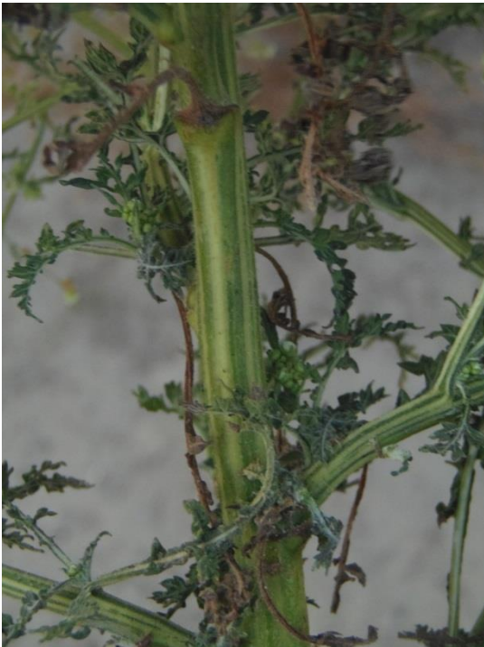
Stems are ridged and angled.