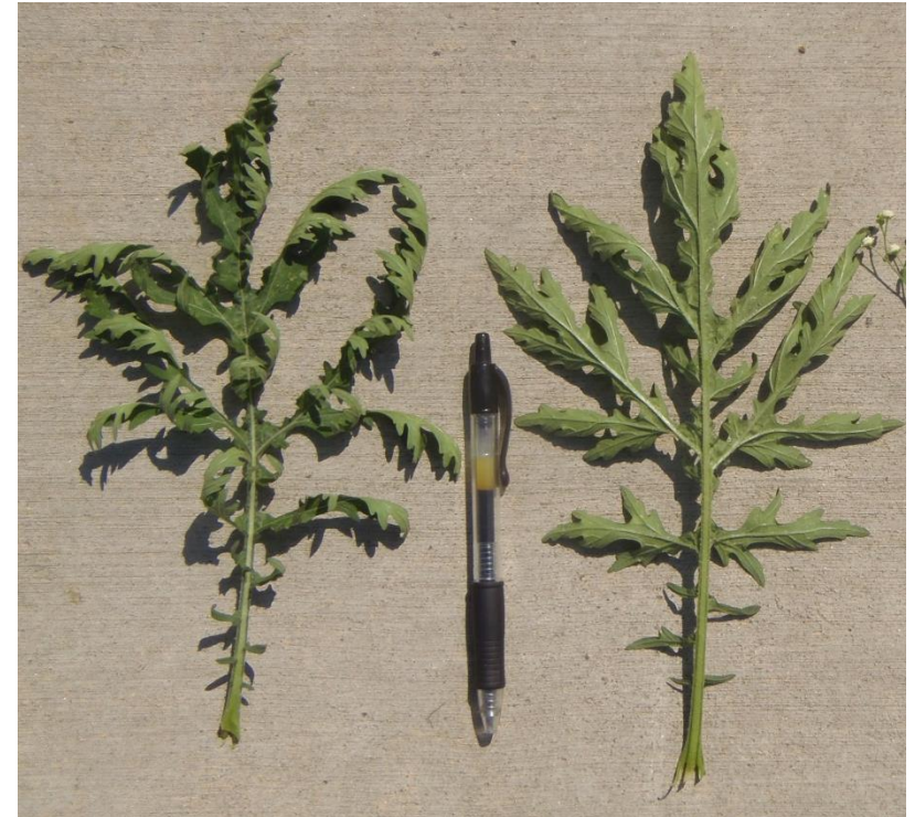
Santa Maria Feverfew has been shown to cause severe dermatitis and allergic or poisonous reactions for people and agricultural workers and should not be handled with personal protective equipment, especially gloves.