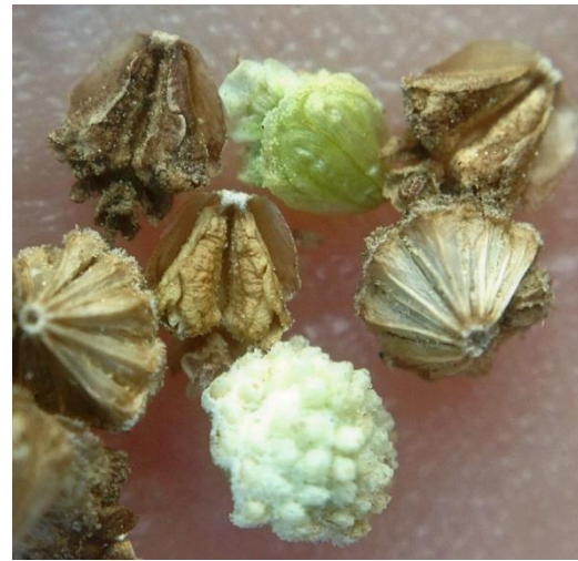
A serious agricultural weed exhibiting strong allelopathic characteristics.