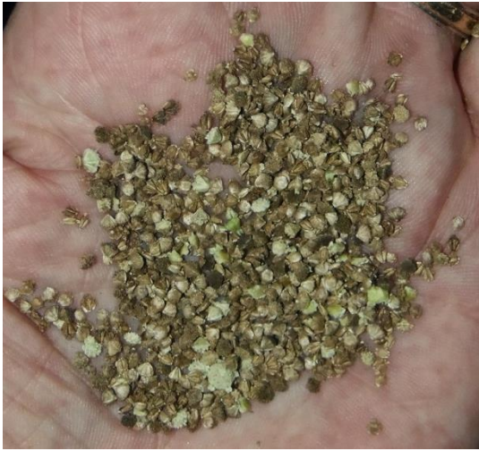
Prolific fruit and seed production over a very long season.