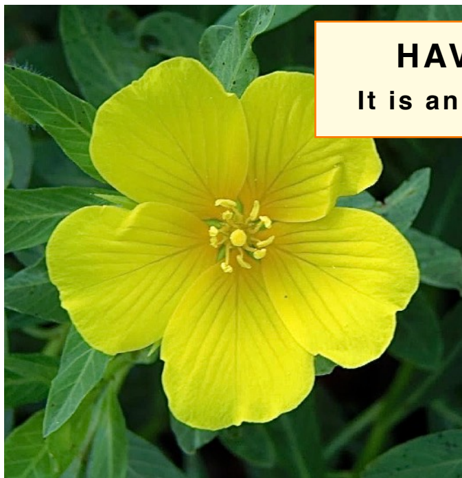
Flowering is from May to Dec.