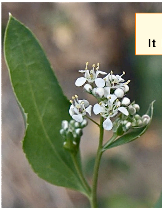
Flowering is May-July.

Can be confused with: Whitetop, Lepidium draba